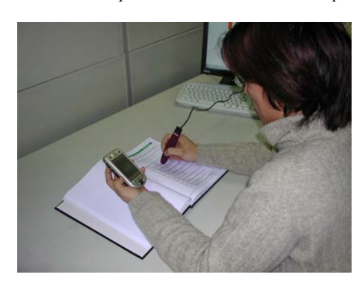
Figure 1: Using Hard SCORM LMS

A formal definition of the functionalities and system response actions of these tags are also defined. The definition uses a set of icons for the tags. The activation of these tags will change SCORM variables in an activity tree while the LMS is running. Note that, the LMS is implemented on a PC, which serves as a backend server of Hard SCORM LMS. The Hyper Pen is connected to PC. Wireless communication will be used in the near future to enhance the flexibility of Hard SCORM. Figure 1 shows a section of Hyper Pen navigation on a textbook. The student is using a Hyper Pen to read textbook. A PDA is used to see multimedia presentations (such as video). And a backend computer had audio message to guide the student. Audio signal enforces the student to follow the sequence and navigation definition of a SCORM-compliant courseware.